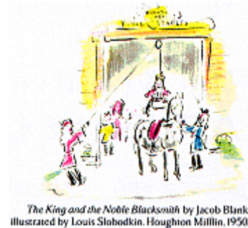
The King and the Noble Blacksmith by Jacob Blunk, illustrated by Louis Slobodkin, Houghton Mifflin, 1950.