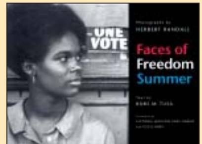
Cover from Faces of Freedom Summer . Printed with permission, University of Alabama Press.