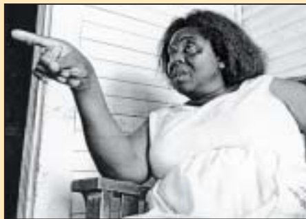
Fannie Lou Hamer Oral histories of the Civil Rights Movement